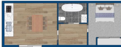
CABINS 1, 2, 3, 4, 5, 6, 7, 11, 12, 13, 14, 15, 16