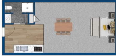
MOTEL 3, 4, 5