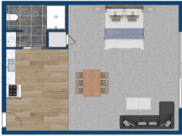
MOTEL 1 & 2