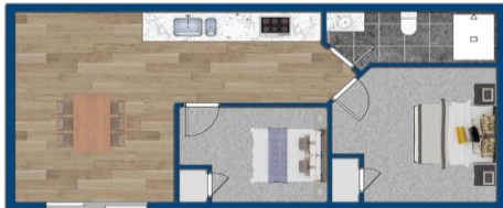
CABINS 7, 8, 10