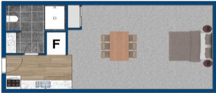
MOTEL 7, 8, 10, 11