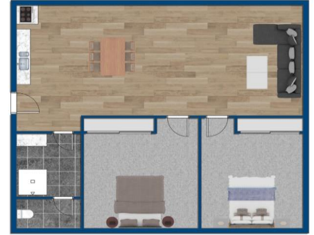
MOTEL 6 & 9