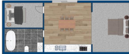
CABIN 9 (DISABILITY ACCESS)